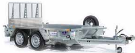
GP106 175 x 16 wheel