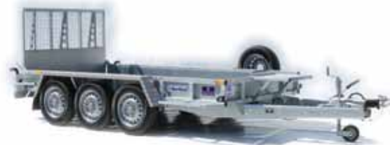
GP126 Tri Axle