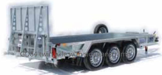
GP146 Tri Axle 175 x 16 wheel