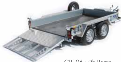
GP106 with Ramp