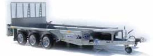
GX126: 12' x 6'1" Tri Axle