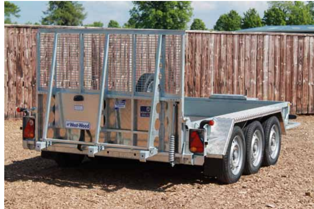
GP126 Tri Axle 175 x 16 wheel